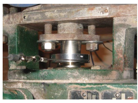
Optional Rotary Shaft Adapter shown

The Stem Position Encoder (SPE) provides the valve tester with a convenient means to accurately measure valve stem position. This custom "string pot" has a magnetic base and a variable orientation to allow the user to properly adapt to a variety of valve bodies and actuators including MSIVs, AOVs and MOVs. The SPE provides a calibrated signal for input to the QUIKLOOK Data Acquisition Systems.